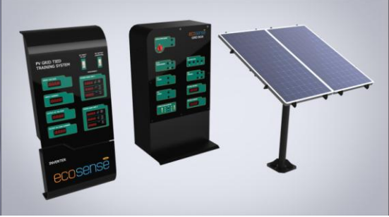
Solar PV Grid Tied Training system