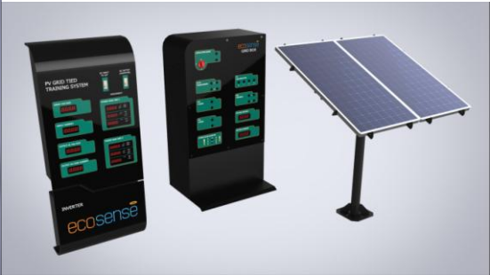
Solar PV Grid Tied Training system